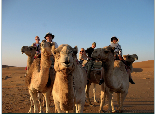
A camel safari.

out at sea, game reserves and acres of high-rise shopping malls. Driving around the city at present is a nightmare. It is like one great construction site, with the much-quoted figure of a quarter of the world's construction cranes and heavy machinery to match. Literally kilometres of trucks and cement mixers continually move around the ring roads.