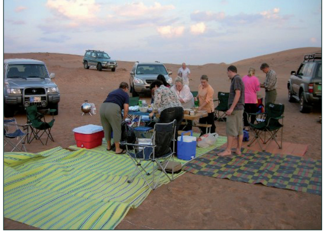
Braai in the desert.

building is divided into separate halves for females and males, and we teach the sexes separately – a sort of gender apartheid. A faculty chaperone must be present if there is to be a meeting of both male and female students. Female medical students comprise between seventy and eighty per cent of each year. All dress in the black abayas with head scarves ( shailas ), and about a third also wear the face veils ( niqabs ).