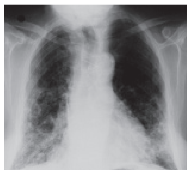
Fig. 1. Above: chest radiograph taken in 1996, showing cardiomegaly and old asbestos plaque. Below: the current film, showing cardiomegaly and interstitial changes mainly at the bases with no signs of cardiac failure.