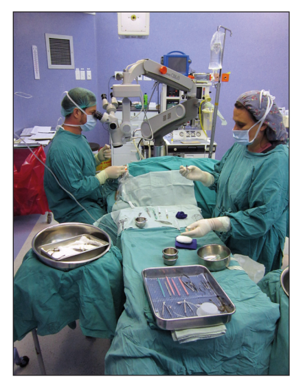
Port Elizabeth surgeons remove cataracts for an indigent patient.

their team is coming to eliminating blindness in their area. From two consultants and three MOs, their department has blossomed to four consultants, four registrars and four MOs, increasing capacity, with the use of a third theatre at Port Elizabeth Hospital now a top priority.