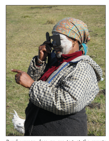
Rural woman does an eye test at the remote Bulungula Lodge near Coffee Bay.

With just 18 in-patient beds they've finally convinced hospital management to provide day-case beds for them (day-case CS is standard at private eye hospitals), addressing one of the three main reasons for procedure cancellations (no consumables, equipment or day beds). Working with the prestigious Australian-founded Fred Hollows Foundation that targets Third-World countries, today they receive regular large consignments of vital lenses, sutures and visco-elastics (a jelly to protect the cornea and keep the eye firm while they operate), plus logistical help in Graaff-Reinet. The Nelson Mandela Metropole (covering Port Elizabeth, Uitenhage and Dispatch) has a drainage of 1.2 million people - giving a strong indication of how close the work of