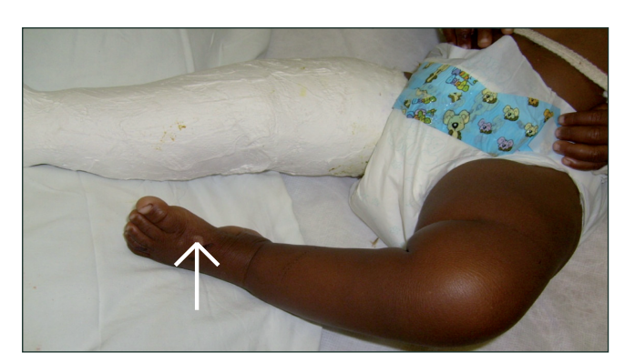
Fig. 1. Skin lesions (arrows).

Not all infants with fractures are investigated, raising the question, how often does this silent pandemic go unnoticed?