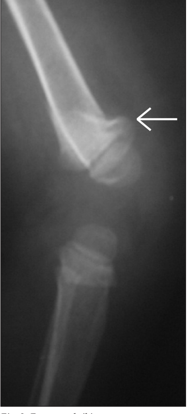
Fig. 2. Femur and tibia.

Corresponding author: X Mgele (mgelex@telkomsa.net)