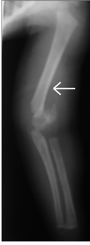
Fig. 3. Elbow.