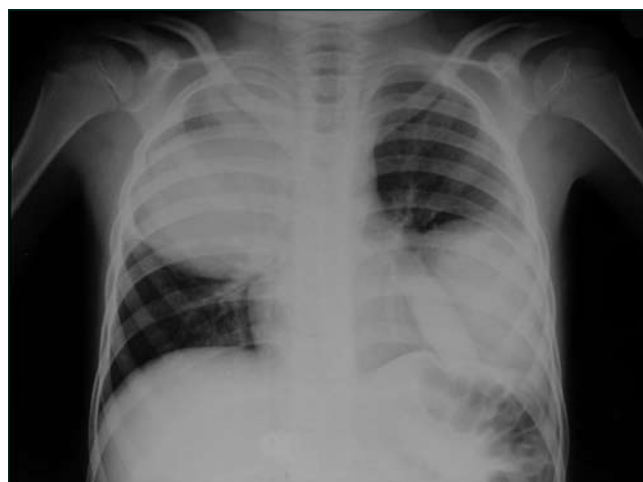
Fig. 1. Chest radiograph showing a bilateral well-circumscribed dense lesion.

The patient was treated with high protein intake, dipyridol and captopril; both right lung cysts were resected,