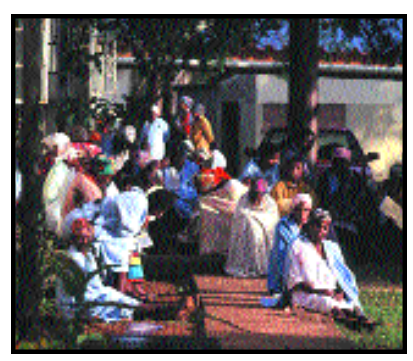
Patience is the operative word at rural clinics like this one at Mosvold Hospital in Northern KwaZulu-Natal.

Conflicting and potentially destructive perceptions exist between the DoH and many interns. The former believes interns are bent on securing 'cushy' posts in luxurious provinces instead of being prepared to buckle down and contribute to health service delivery where it is most needed. The latter believe their willingness is misunderstood and that they are victims of an inefficient, unfair and clumsy allocation system run by officials who deliberately exclude them from ongoing policy formation which intimately affects their lives.