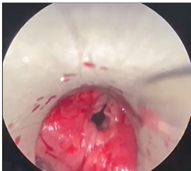
Fig. 1. Direct laryngoscopy showing areas of diffuse inflammation of the supraglottis.

MCV = mean cell volume; ELISA = enzyme-linked immunosorbent assay; CCP = cyclic citrullinated peptide; HCO 3 = bicarbonate; BE = base excess.