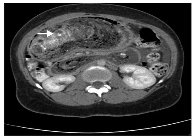
Fig. 3. (B) Computed tomography scan of the abdomen, showing a gastric trichobezoar extending into the jejunum.

contained gastric perforation, and a jejunal perforation was found in 1 patient. All 5 bezoars extended into the jejunum, the longest measuring 1.4 m; 2 consisted entirely of artificial hair extensions. All patients had an uncomplicated postoperative course and 4 were referred for psychiatric evaluation.