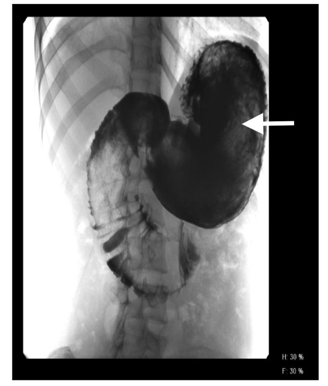
Fig. 2. Barium meal examination, showing a gastric trichobezoar with extension into the duodenum.