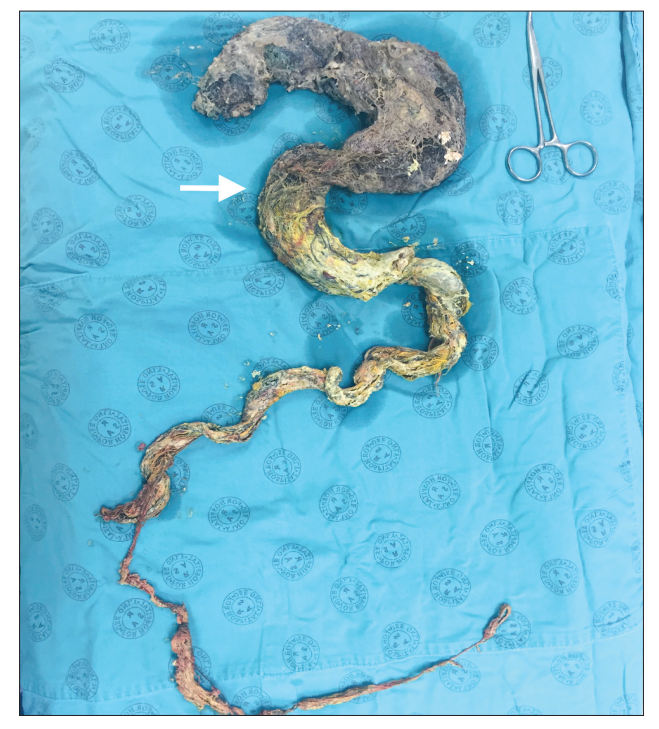
Fig. 5. Removal of a 1.4 m trichobezoar.

10 - 18% of bezoars are recognised on radiographic features alone.<sup>[24,25]</sup> A barium meal may demonstrate a filling defect in the stomach and confirm the diagnosis. Both ultrasound and CT scans have been shown to be reliable methods for diagnosing trichobezoars and distinguishing them from other possible causes, particularly when an abdominal mass is palpated. Abdominal ultrasound scanning might demonstrate increased echogenicity, with a marked acoustic shadow due to intermixed hair and food, and CT imaging might show a low attenuating heterogenous mass containing trapped air, with oral contrast most prominent at its margins.<sup>[26,27]</sup> In a retrospective analysis of 17 patients with GI bezoars by Ripollés et al. ,<sup>[24]</sup> sonography detected only 25% of gastric bezoars, while CT imaging indicated the preoperative diagnosis in all patients. Upper GI endoscopy, however, remains the gold standard for diagnosis and also allows for treatment options in selected cases of small trichobezoars.<sup>[28,29]</sup>