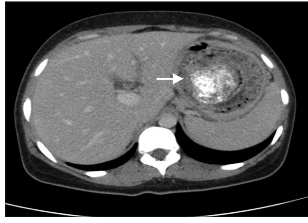
Fig. 3. (A) Computed tomography scan of the abdomen, showing a gastric trichobezoar.