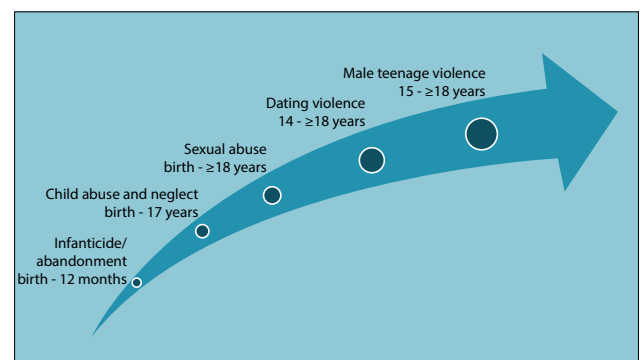
Fig. 1. Violence against children across the life course (from Mathews and Benvenuti, [7] with permission).

Violence starts in the home where young children are most at risk of physical abuse, neglect and abandonment. At school, corporal punishment, bullying and sexual violence become more prevalent. Teenage boys are most at risk of interpersonal violence, while teenage girls are more likely to experience sexual and physical violence in the context of dating relationships; [7] >33% of teenage girls report forced sexual initiation. [8] Understanding how patterns of violence change across the life course enables the adoption of a proactive approach to violence prevention – intervening early before patterns of violence become entrenched (Fig. 1).